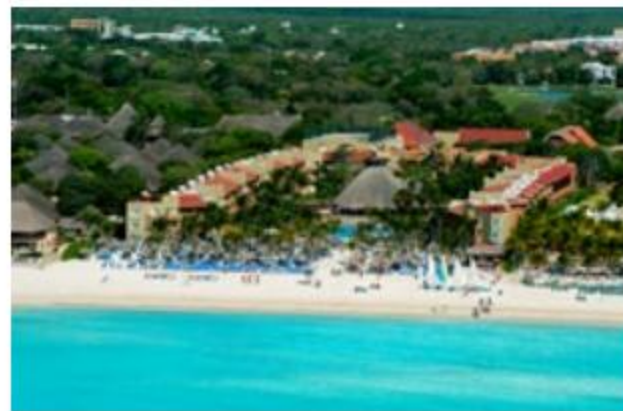
Viva Wyndham Azteca Riviera Maya, Mexico