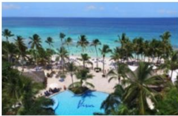
Viva Wyndham Dominicanus Beach La Romana, Dominican Republic