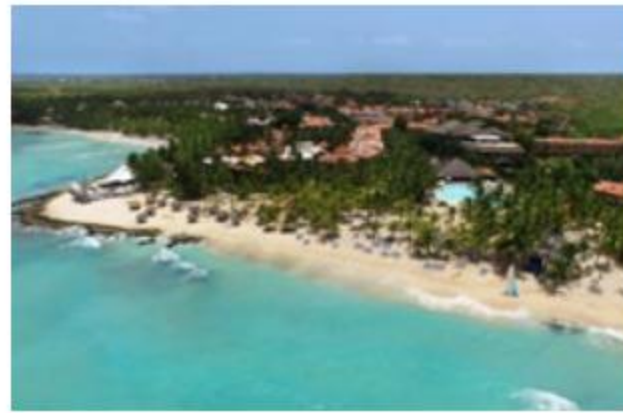
Viva Wyndham Dominicanus Palace La Romana, Dominican Republic