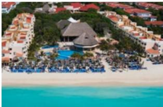
Viva Wyndham Maya Riviera Maya, Mexico