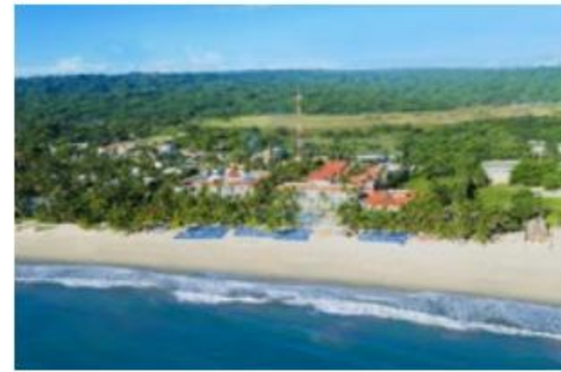
Viva Wyndham Tangerine Cabarete, Dominican Republic