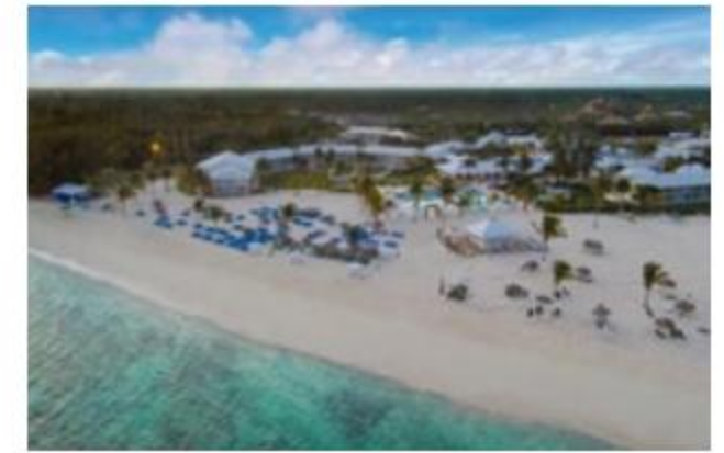
Viva Wyndham Fortuna Beach Grand Bahama, Bahamas