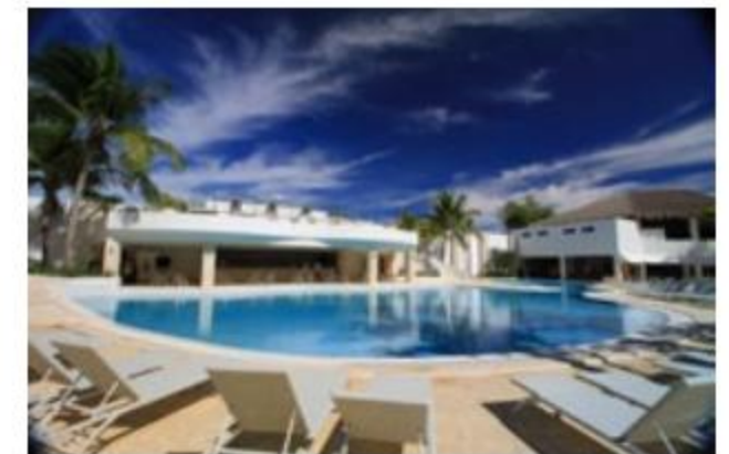
Viva Wyndham V Heavens Puerto Plata, Dominican Republic Adults Only