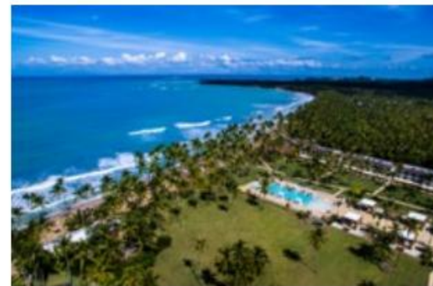
Viva Wyndham V Samaná Samaná, Dominican Republic Adults Only